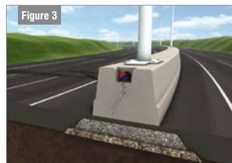
Lighting Column mounted on TWCSB

Standards referenced above are applicable to the UK. For other locations refer to equivalent national standards.