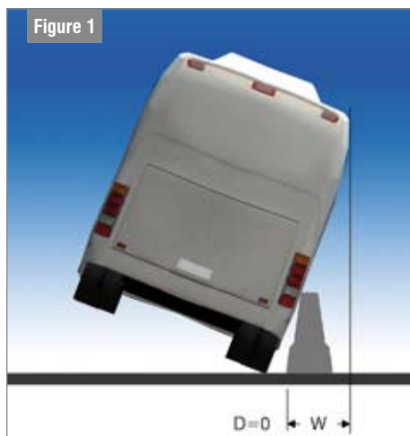
Dynamic deflection (D) and working width (W) for CSB

Working width is defined as the distance between the barrier side facing the traffic before impact of the road restraint system and the maximum dynamic lateral position of any major part of the system 1 , as illustrated in Figure 1.